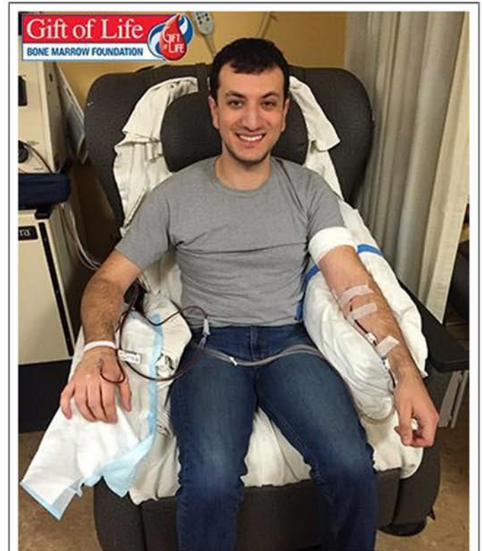
A donor in the middle of donating his stem cells.

The CURE to some blood cancers is in YOUR body! You just need to join The Registry to be searched and matched with a patient in need!