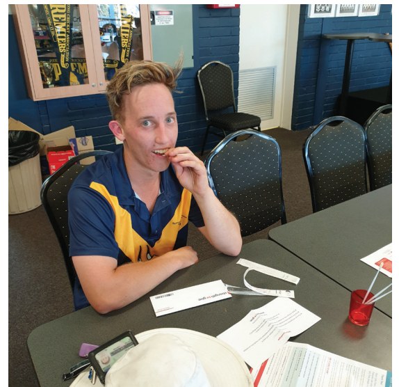
A young cricket player completing his cheek swab at his club.

Only a small number of people are called and asked to donate their stem cells. If you're matched with a patient in need, 90% of the time donating stem cells is like giving blood. It's simple and can save a life!